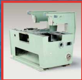
▲ A Diehl rip saw stripped down to the frame ready for remanufacturing