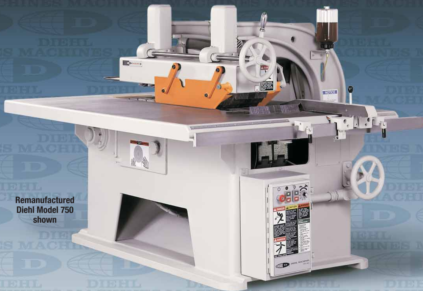
Remanufactured Diehl Model 750 shown