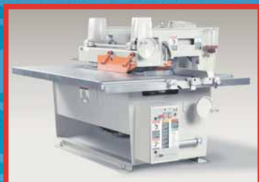
▲ Remanufactured SL-50