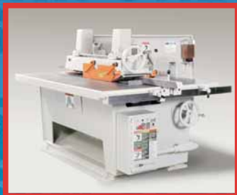
▲ Remanufactured SL-52