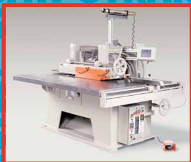
▲ The Wise Guide automatic positioning stock guide with yield optimization is shown on a Remanufactured 750