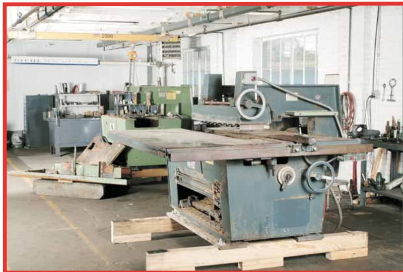
▲ A Diehl SL-52 Straight Line Rip Saw returned to the factory after years of hard production use. Positioned in-line and ready for remanufacturing.

Insist on a genuine factory remanufactured saw with all the latest safety equipment, technical improvements and one year warranty only available from Diehl Machines.